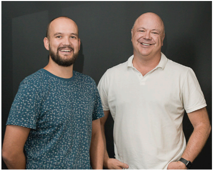
By Jacques Pansegrouw and Georg van Gass from GASS Architecture Studio

The quality of the public space and the broader architectural character of the precinct is designed not only to catalyse and support a greater diversity of people within the precinct, but also to invite and encourage further investment into the CBD. The peripheral areas and side-walks along the busy Commissioner and Main Streets have been repaired and upgraded, and additional lighting was introduced to create a cleaner, safer space around the precinct as well.