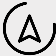
Mirriam Makeba St Onramp, Johannesburg